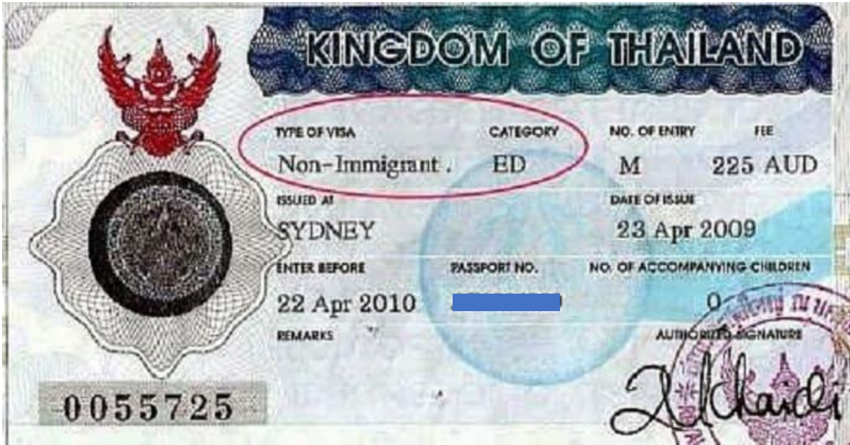
Applying from a Royal Thai Embassy overseas