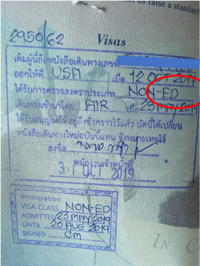
Converting Visa to a Student Visa at The Thai Immigration Bureau